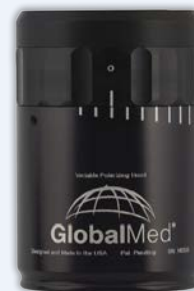
For use with general viewing lens

For further assistance and technical support, contact OTN Technical Support: