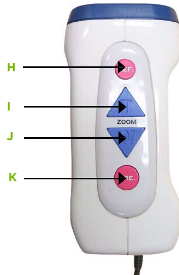
AMD-2500 Top view